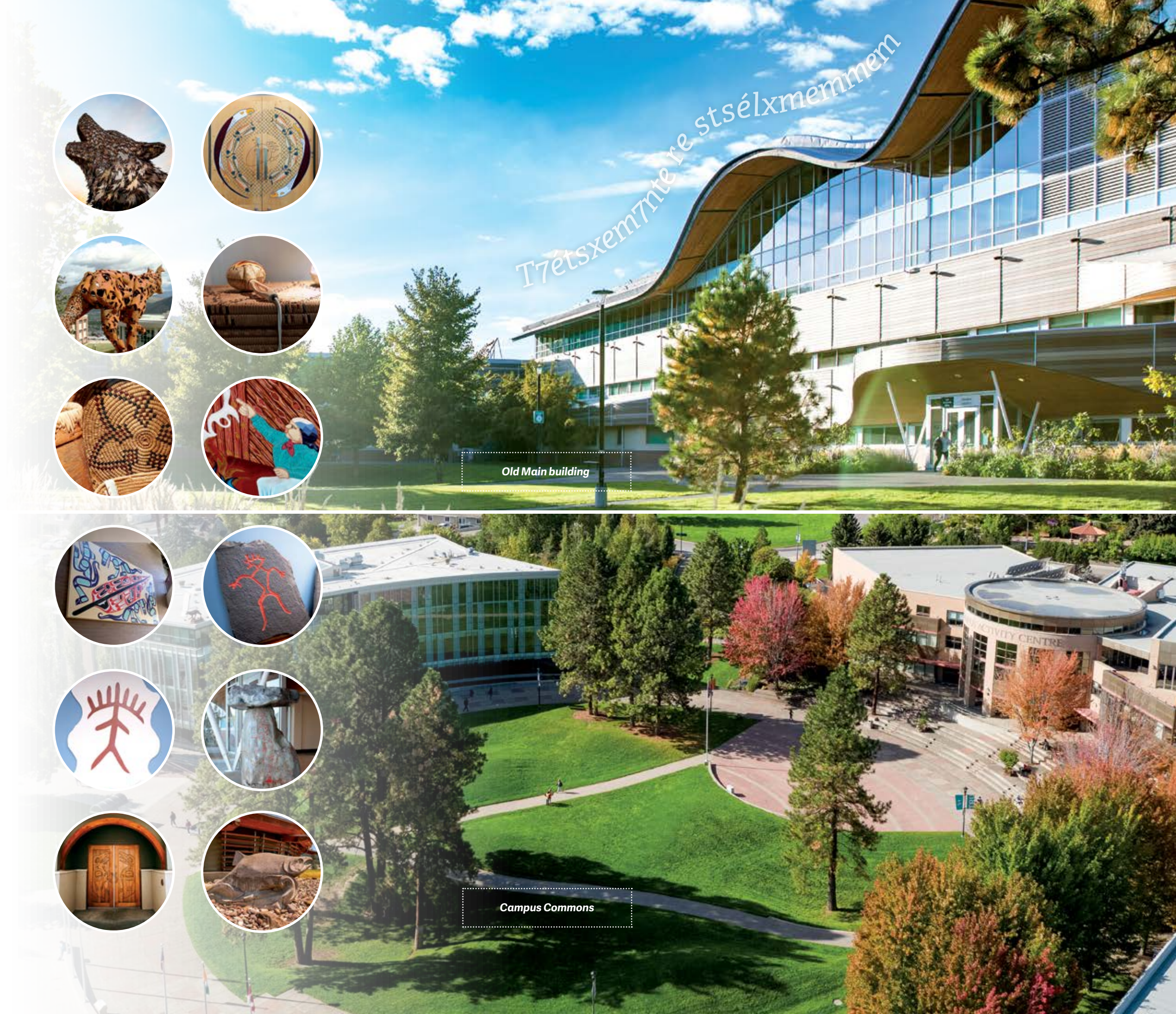
Old Main building