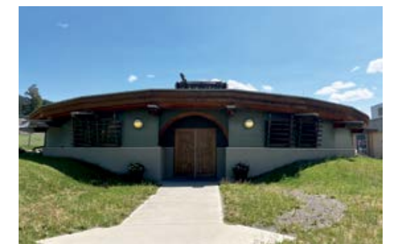
The Gathering Place in Williams Lake.