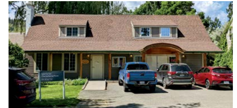
Cplúl'kw'ten (House 5) on the Kamloops campus.

Cplúl'kw'ten provides a social support system to help enhance your sense of community at TRU as well as advocates on important issues including discrimination and harassment. Join us for potlucks, social events and other fun events in a culturally-safe space. You will also be able to connect with an Indigenous counsellor through TRU's Counselling Services.