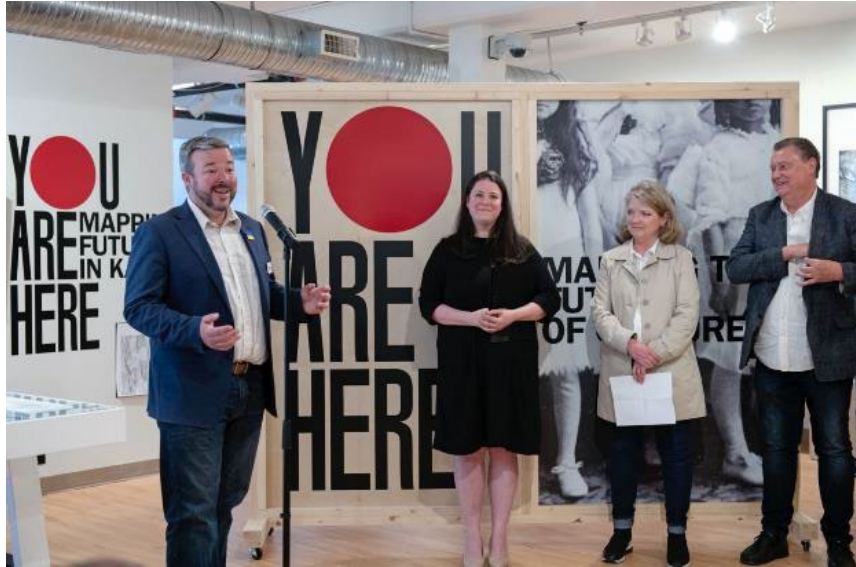
Launch of You Are Here Project at the Kamloops Museum- Collaborative Research Project between the City of Kamloops and TRU to inform the new cultural strategic plan